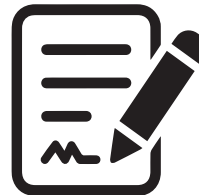
Pen and Paper