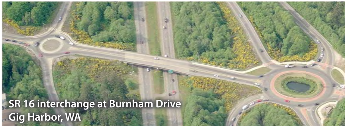
SR 16 interchange at Burnham Drive Gig Harbor, WA