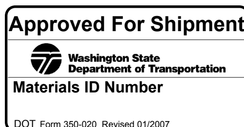
Figure 9-6 Tag

All documentation associated with the tag in Figure 9-6 will be reviewed and approved by the WSDOT Materials Fabrication Inspection Office and kept at the WSDOT Materials Fabrication Inspection Office and kept at the point of manufacture.