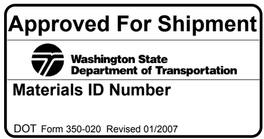
Figure 9-6 Tag

All documentation associated with the tag in Figure 9-6 will be reviewed and approved by the WSDOT Materials Fabrication Inspection Office and kept at the WSDOT Materials Fabrication Inspection Office and kept at the point of manufacture.