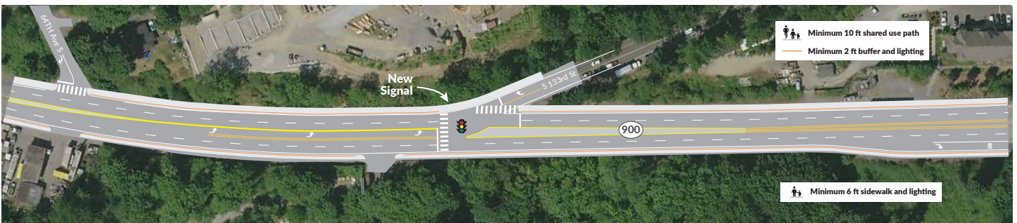
Qeybta 3: Inta u dhaxaysa 64th Avenue South iyo 68th Avenue South

Xarumaha lasoo jeediyay waxaa kamid ah ugu yaraan wado 10-talaabo ah oo la wadaago ee leh xakameeyaha saxmada ee dhinaca waqooyi ee SR 900 oo loogu talagalay dadka lugaynaya iyo baaskiil wadayaasha, oo ay la socdaan nalalka iyo astaamo muuqaal leh. Wadada la wadaago waxay ku xirtaa wadada gawarida ama dib u eegis lagu sameeyo wadooyinka gawaarida eee jira si loo hormariyo