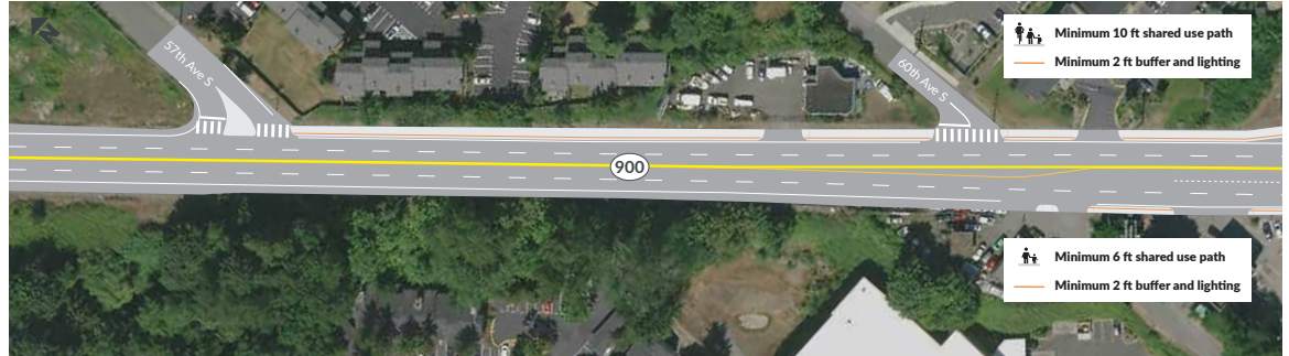
Qeybta 1: Inta u dhaxaysa 57th Street South iyo South 129th Street