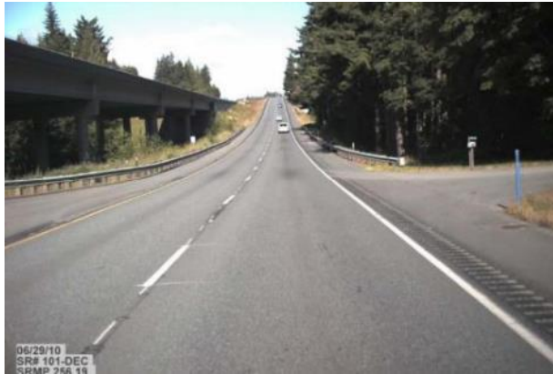
Exhibit 720-1 Phased Development of Multilane Divided Highways

When there is a median gap between bridges of 6 inches or more, the Region PEO will evaluate whether or not the median gap needs to be screened. Address the potential for pedestrians on the bridge and if closing the median gap to less than 6 inches, or installing fencing, netting, or other elements to enclose the area between the bridges would be beneficial. Document this evaluation in the Basis of Design and Alternatives Comparison Table.